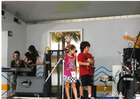
Keep on Rockin' in the Free World